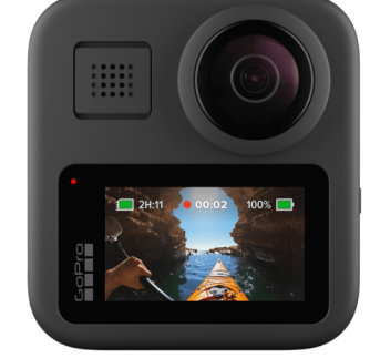
Figure 3: View of GoPro Max touchscreen/ https://gopro.com/