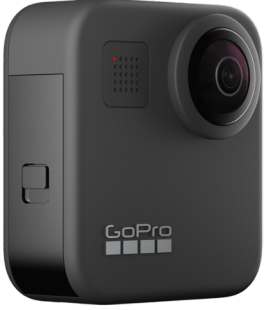
Figure 1: View of GoPro Max front/ https://gopro.com/

The GoPro Max functions similar to a standard camera for capturing videos and images. The notable difference is that it has two lenses (see fig. 1). To capture 360 content, users can toggle between standard and 360 videos by using the icon in the lower-left corner of the touchscreen (see fig. 2). Once the setting is selected, video can be captured by using the record button. Despite the simplicity of the process, the camera setup is pivotal. Any camera motion will cause users to become disoriented when capturing 360 videos for VR. It is essential to capture multiple scenes via cuts in the video instead of physically moving through space. Also, the position of the camera relative to the scene is essential. The circulating GoPro kits include small portable tripod approximately two feet high. These are mobile, but it is better to place the camera lens at head level. Doing so ensures any narrators do not tower over the VR viewers and reduces a viewer's sense of displacement due to height change. Finally, trim the video at the start and end of the footage. Trimming footage in the GoPro app is easy and will remove the awkwardness of moving away from the camera or interacting with a phone at the start and end of image capture.