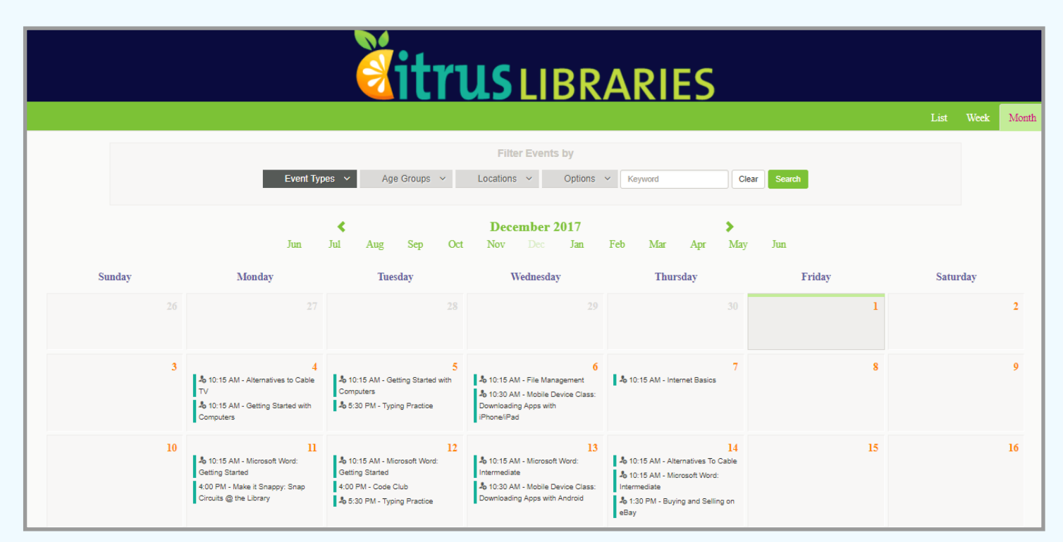
The Citrus County Libraries online calendar shows new classes in December including mobile device classes on December 6 and 13, and buying and selling merchandise on eBay.

Getting buy-in from stakeholders is essential. In our case, that included library administration, our IT department, and our more traditional staff members. The IT department had concerns about device security—we had to assure them that patron's personal devices would not be connected to the county network. In addition, they were concerned about the surge in bandwidth usage during the classes. In order to ensure that bandwidth would not be a problem, we examined the charts of bandwidth usage and held classes during times with lower average bandwidth usage. In addition, we made sure that the majority of our classes did not require the use of Wi-Fi. Administration had concerns about cost (both in staff time and in financial costs) of development, and we were able to demonstrate that the programs used free software and the patrons own devices and did not involve any financial commitment. Staff time was needed, but only in the context of curriculum development, which was already a responsibility of our instruction and research team. Lastly, we had to get buy-in from traditional staff members. In traditional classes,